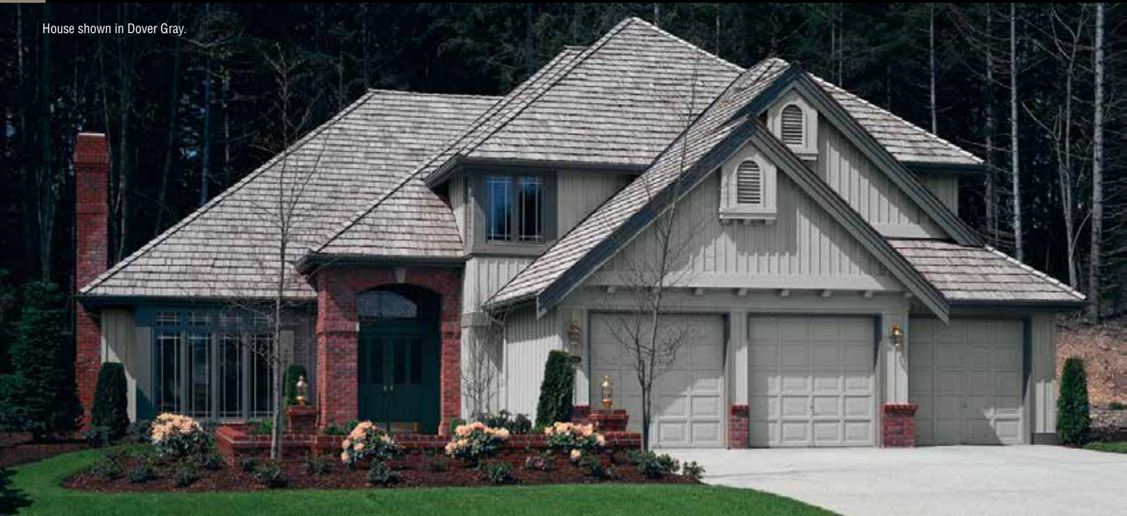
House shown in Dover Gray.

Board & Batten's unique vertical design marries historical appeal with modern practicality. Featuring an authentically proportioned 7" exposure with a 5-1/2" board and 1-1/2" batten strip, this ultra-premium panel works well as a whole-house exterior or as an accent siding.