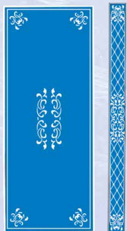
A. One Lite B. Tri-Lite