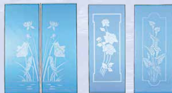
A. Lotus B. Rose C. Lily