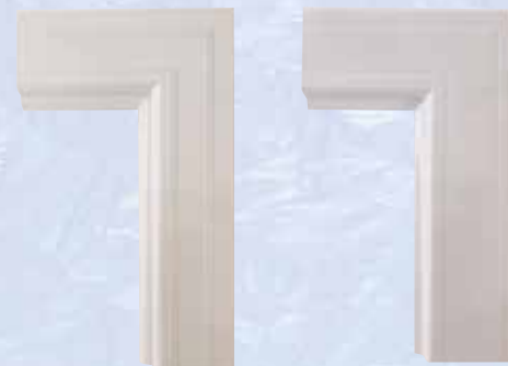
Traditional 2" Doors