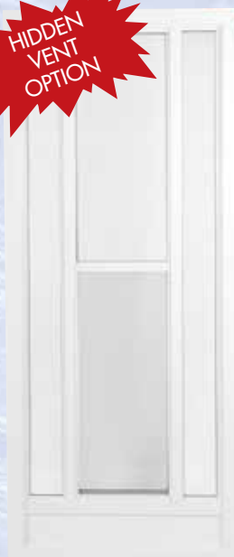
TRI-LITE 2" TRADITIONAL ONLY